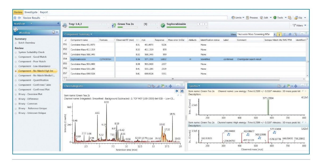
Figure 4. The final identification result of the unknown sample is shown in Compound Summary List in the Review interface.