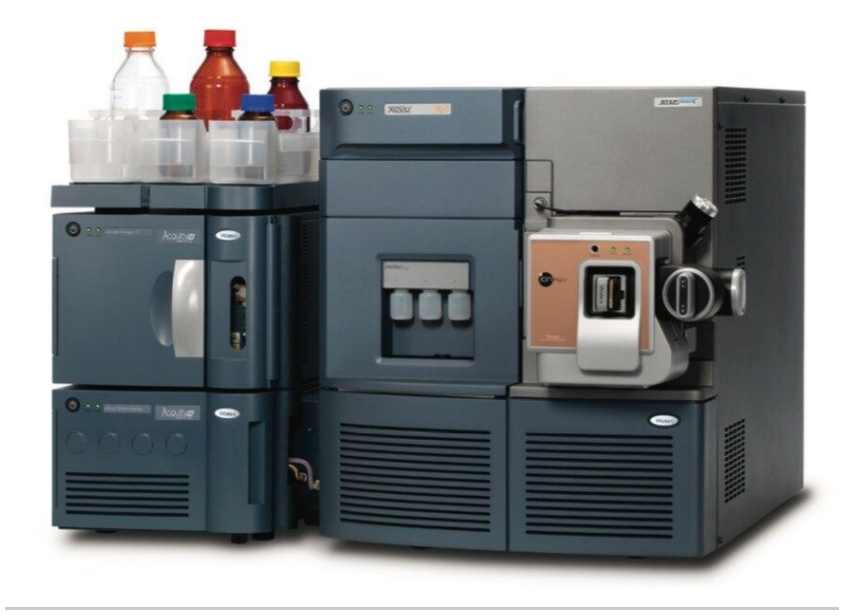
Figure 1. ionKey/MS System: comprised of the Xevo TQ-S, the ACQUITY UPLC M-Class, the ionKey source and the iKey separation device.