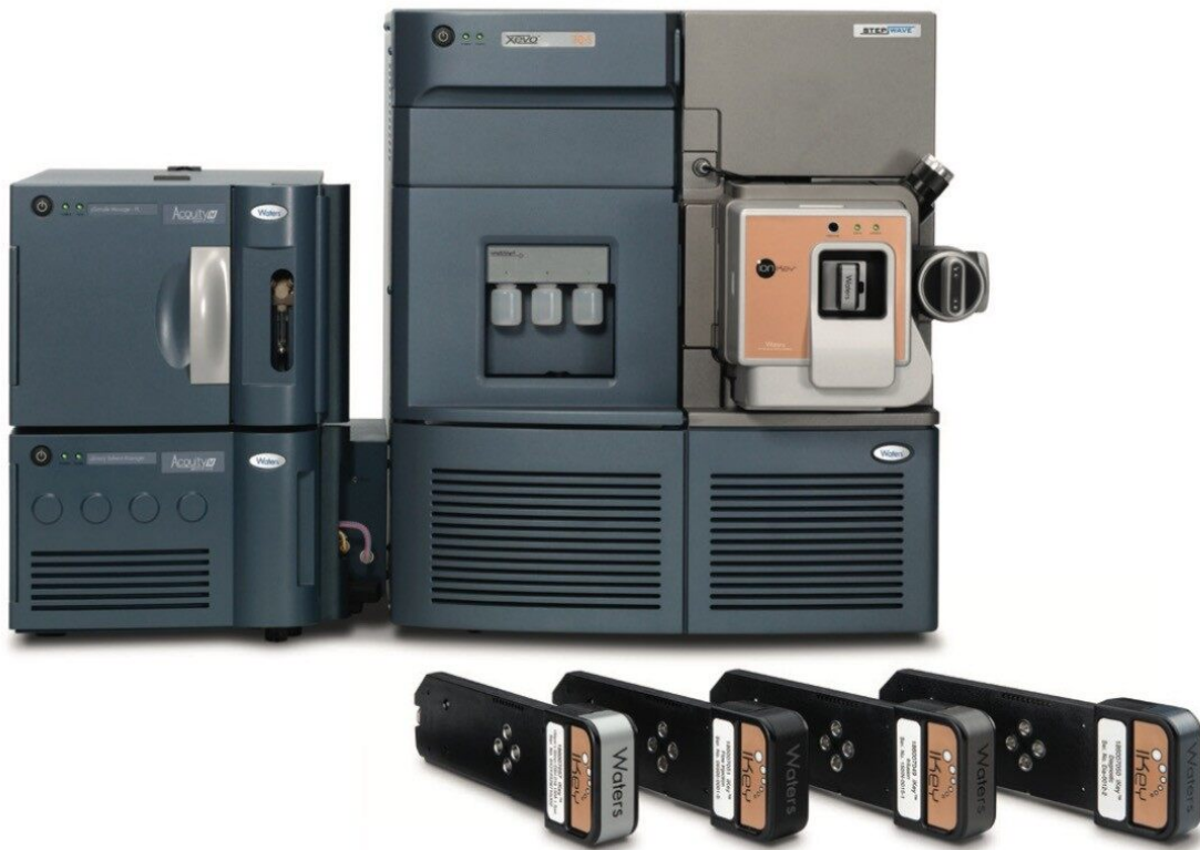
Figure 1. ionKey/MS System: comprised of the Xevo TQ-S, the ACQUITY UPLC M-Class, the ionKey source and the iKey separation device.

Figure 2 illustrates the separation of a peptide standard utilized in the evaluation of the system. As can be observed in Figure 2, the overlay of fifteen different analysis of the peptide standard illustrates the excellent reproducibility of the ionKey system. The data from this evaluation is further displayed in Table 1. The data illustrates average retention times of 6.84 minutes for the peptide standard with 0.1 % RSD. In this evaluation, the peptide standard data was acquired over a course of 500 injections of rat plasma prepared via protein precipitation, utilizing a 15 minute gradient equating to five days of continuous operation.