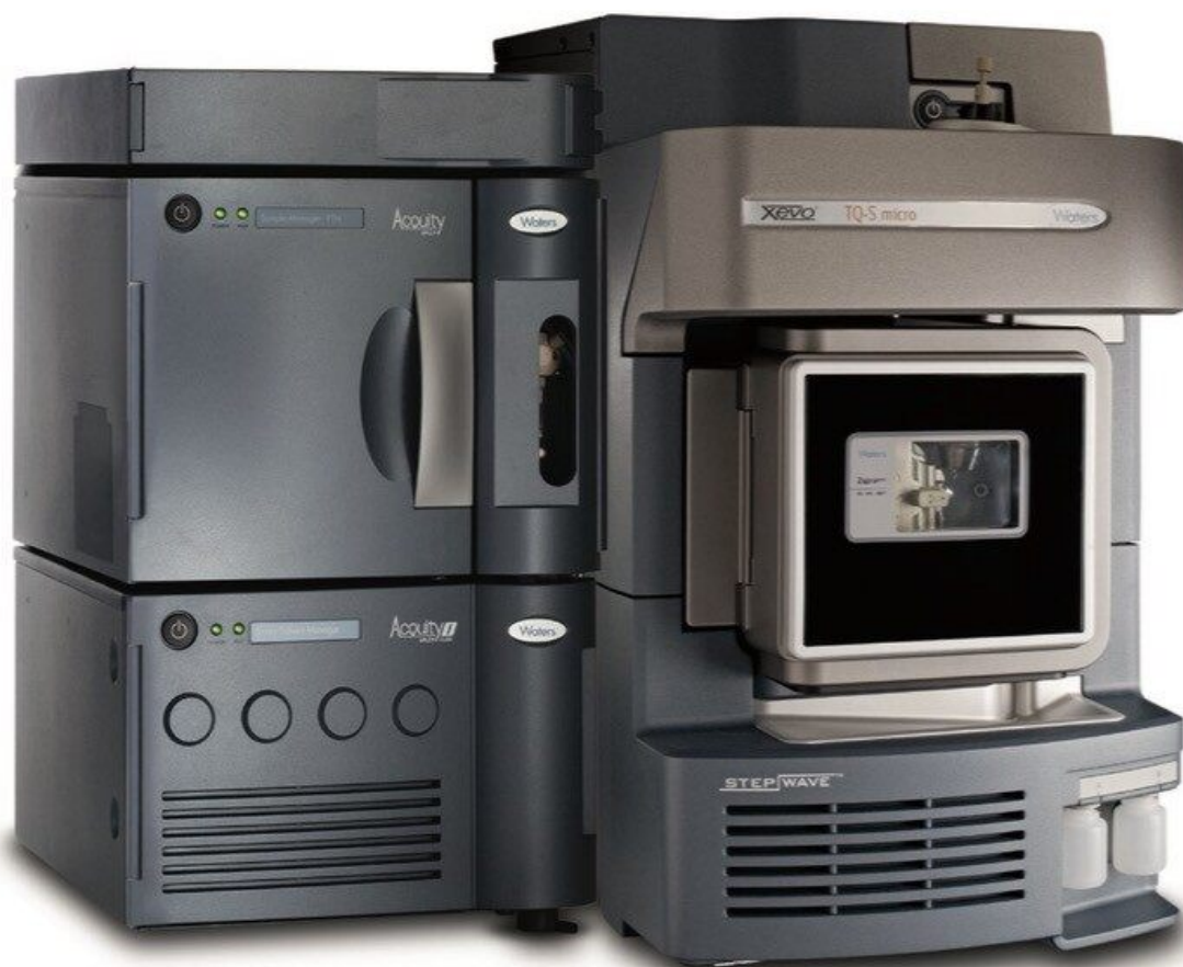
Figure 1. ACQUITY UPLC I-Class and Xevo TQ-S micro configuration.

Combining the ACQUITY UPLC I-Class with the Xevo TQ-S micro allows this established UPLC-MS/MS screening methodology to be used on the latest generation of Waters mass spectrometers.